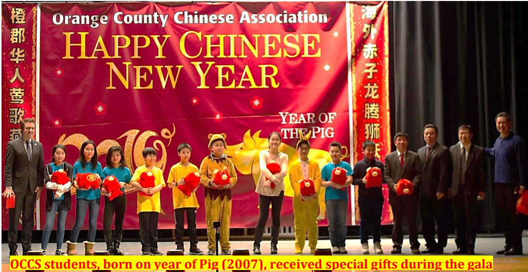
OCCS students, born on year of Pig (2007), received special gifts during the gala